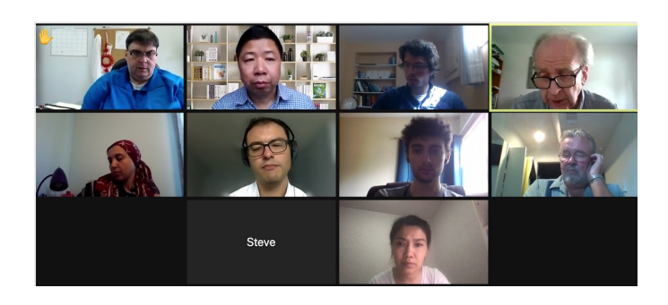
June 29, 2021. Presentation for officers in the ACOA

The team presented our findings of the survey of employers across Atlantic Canada on their attitudes and hiring activities and perception towards newcomers and international students. More than 50 ACOA officers attended the virtual event.