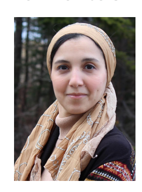
Theme 7 New Members

Cousulations on developing social enterprises for access to culturally diverse food and ingredients